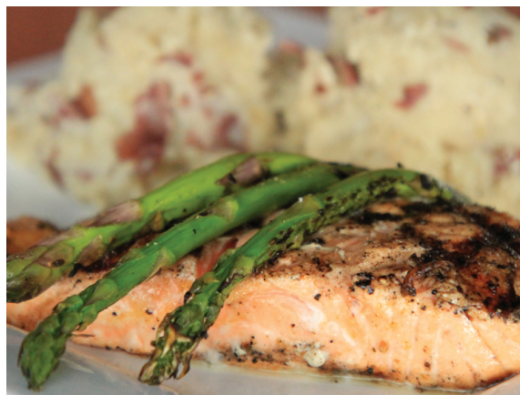
Substitute an Oak Salad 3

Pub Salmon Salmon filet grilled with our homemade seasoning. Served with mashed potatoes & grilled asparagus 28